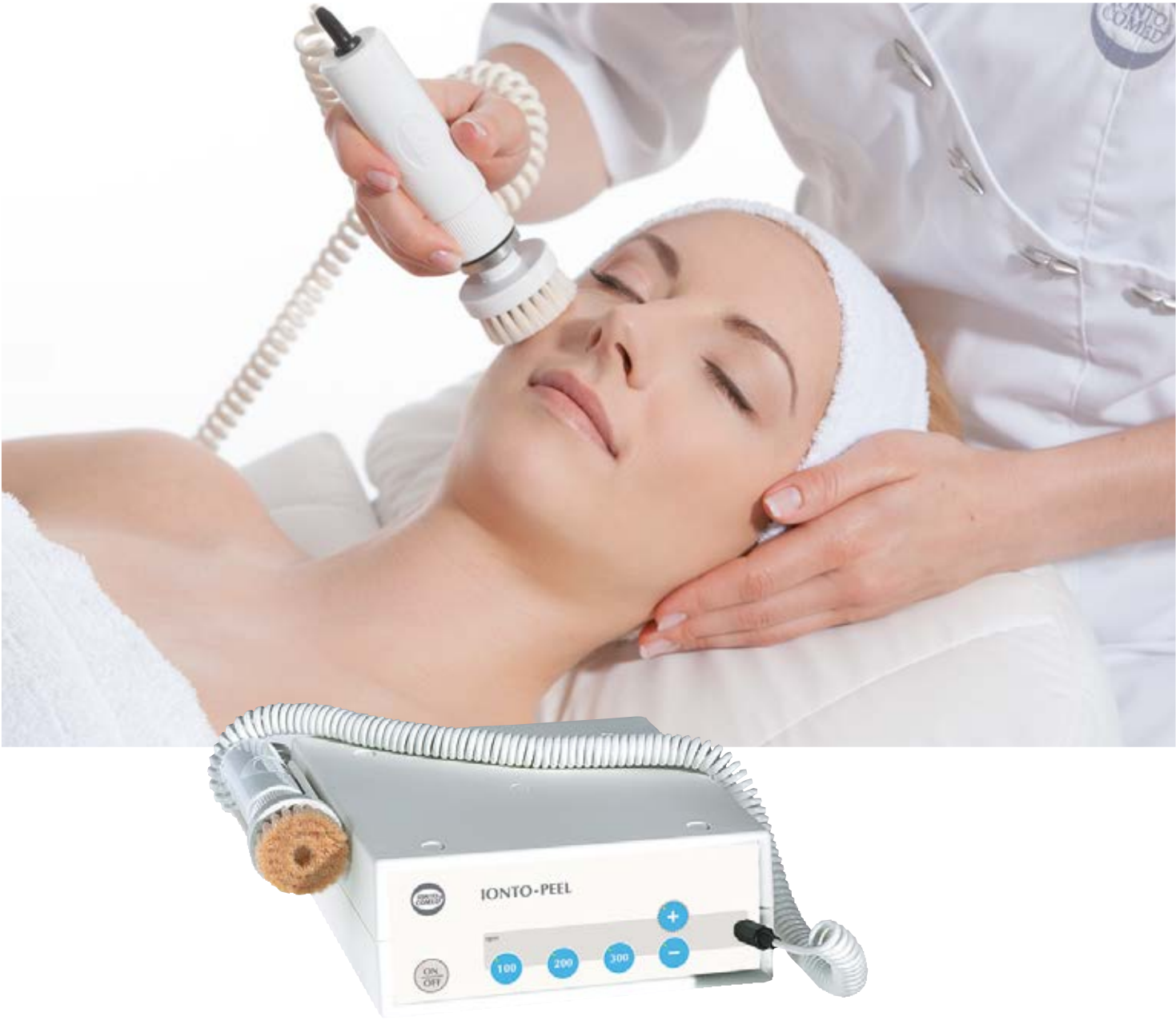
Treatment device IONTO-PEEL®