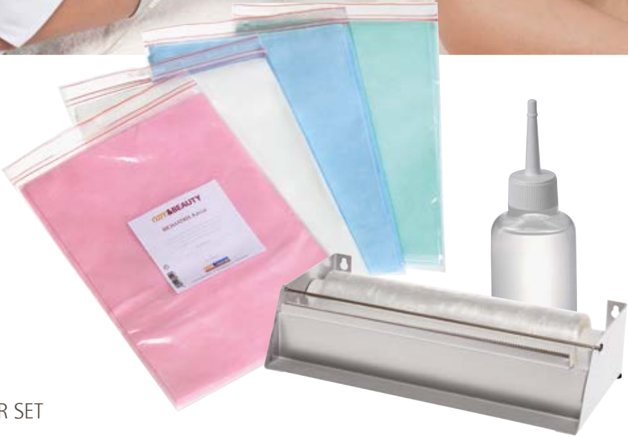
STARTER SET BIOMATRIX Concept

The Decisive Kick: The Micro Massage With the IONTO SKIN REGULATOR Slide over your customer's skin with your hands and make the skin and muscles vibrate gently.