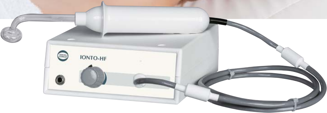
Treatment device IONTO-HF