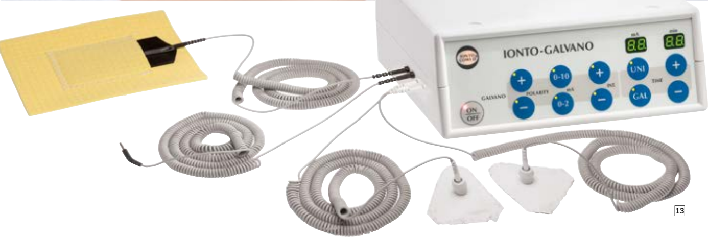
Treatment device IONTO-GALVANO®

i IONTO-GALVANO® is also suitable for galvanic footbath.