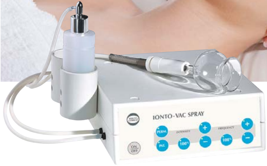
Treatment device IONTO-VAC® SPRAY