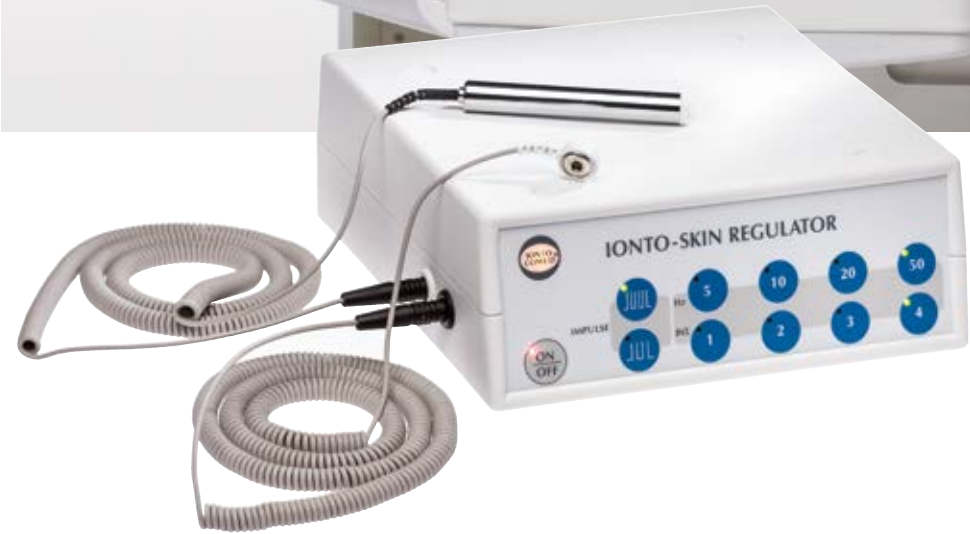
Treatment device IONTO-SKIN® REGULATOR

Suitable for SYMBIOSIS CONCEPT. by IONTO®