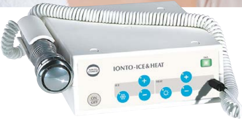
Treatment device IONTO-ICE & HEAT

Suitable for SYMBIOSIS CONCEPT by IONTO®