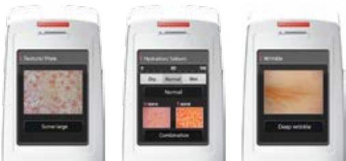
8436.2 IONTO-SCOPE APS II 100